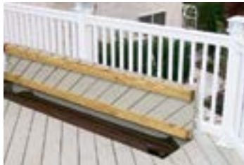
Hot Tub Cover Storage (Open)