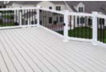
Vinyl Railing & Black Balusters