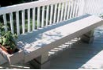
Custom Built-In Benches