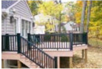
Black Radiance TimberTech Railing