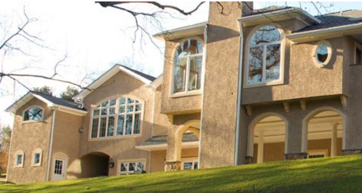
Custom project by Buck Ridge